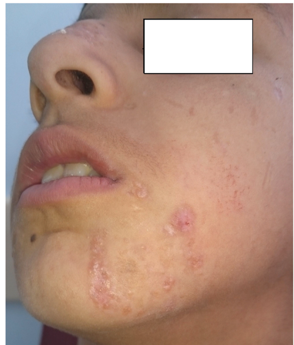
Figure 3. Yellowish-brown, slightly elevated papular lesions located in the left cheek after treatment.