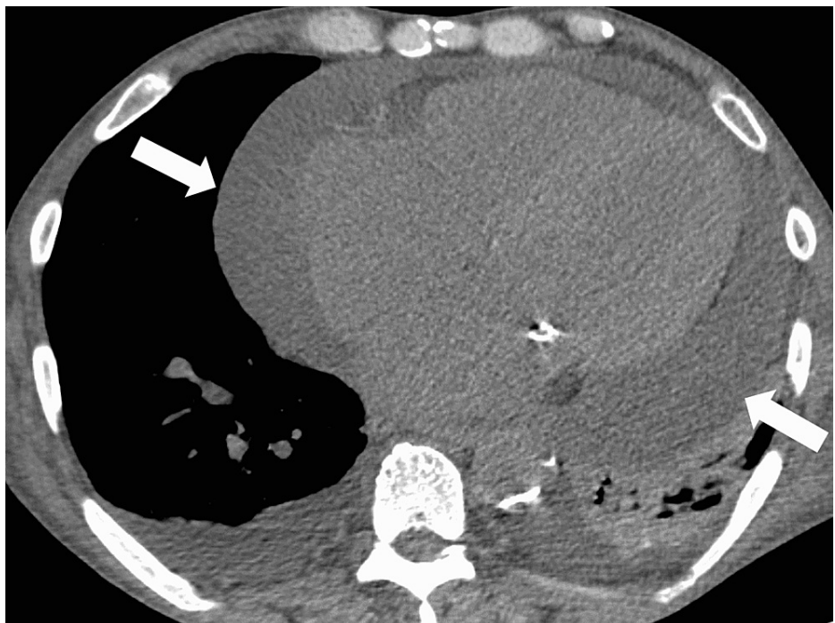
FIGURE 2: Cardiac tamponade on the subsequent computed tomography

The patient was suspected to have congestive heart failure and was admitted for treatment. The two sets of blood cultures were performed to rule out bacteremia. The patient underwent volume control through dialysis; however, chest pain, respiratory distress, and a fever of 38.6 °C were noted. On the second day of hospitalization, chest computed tomography (CT) revealed a large amount of pericardial fluid (Figure 2).