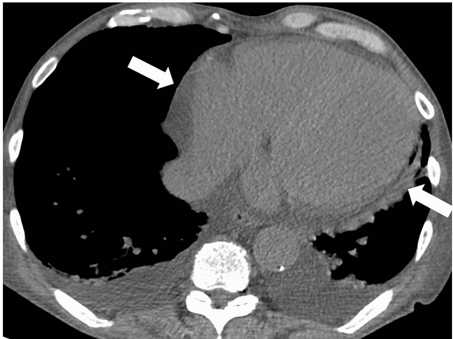
FIGURE 1: Pericardial effusion on the initial computed tomography

The patient was suspected to have congestive heart failure and was admitted for treatment. The two sets of blood cultures were performed to rule out bacteremia. The patient underwent volume control through dialysis; however, chest pain, respiratory distress, and a fever of 38.6 °C were noted. On the second day of hospitalization, chest computed tomography (CT) revealed a large amount of pericardial fluid (Figure 2).