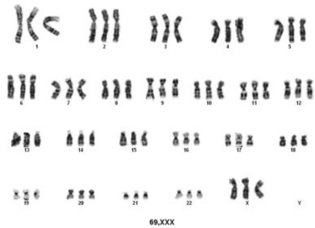
Fig. 4 Chromosomal analysis in case 4 revealed a 69,XXX karyotype.

All triploidy cases in this series were detected by identification of multiple anomalies on routine anatomy US at 18 to 20 weeks' gestation. Although anomalies varied between cases, each of the fetuses had significant US findings, resulting in elective induction of labor in the second trimester. All fetuses and placentas were examined after delivery. US, clinical features, and placental findings from each of the cases are summarized in Table 1 .