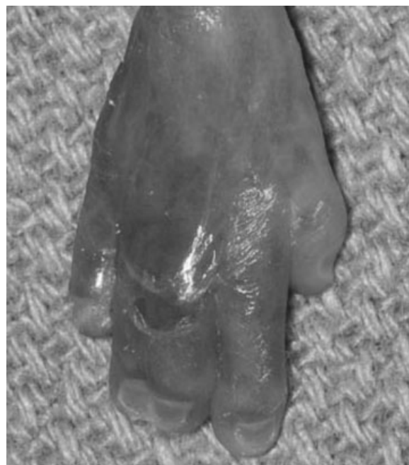
Fig. 2 Physical exam of fetus in case 1 revealed 3,4 syndactyly of the right hand.