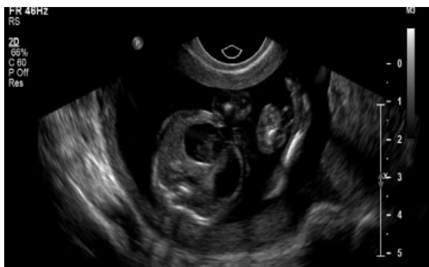
Fig. 1 Transverse view of the fetal abdomen in case 1, demonstrating the classic “double bubble” sign consistent with duodenal atresia. The two cystic structures represent an enlarged fluid-filled stomach and proximal duodenum. The pylorus between the stomach and duodenum is also dilated and visible.

A 30-year-old G2P1001 woman with a spontaneous pregnancy was referred to our institution at 22 0/7 weeks' gestation for multiple anomalies detected on routine anatomy US. Advanced-level US findings included intrauterine growth restriction, Dandy Walker variant, and possible asphyxiating thoracic dystrophy. The patient elected to have an induction of labor due to poor prognosis, and subsequently delivered a stillborn infant. Cytogenetic study revealed a 69,XXX karyotype. Upon physical exam, the fetus exhibited normal female genitalia and growth restriction. Relative macrocephaly with facial asymmetry and low-set ears were noted. The fetus had a widened sternum and short rib cage. Malformations of the extremities included 3,4 syndactyly of the left hand, 4,5 syndactyly of the right foot, and equinovarus (→ Fig. 3A, B ). The placenta had a three-vessel cord and showed no hydropic changes. Placental weight was below the tenth percentile.