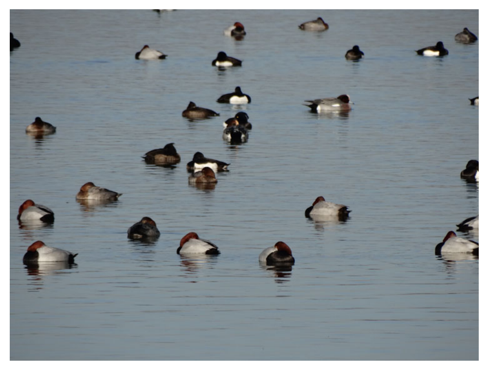
Figure 1. Two wintering male Eurasian wigeons (Anas penelope) (with a yellowish forehead) among tufted ducks (Aythya fuligula) and Eurasian pochards (A. ferina) on 15 February, 2017 at Nuldernauw, Putten, the Netherlands.

was lethal within 1.5-2 days post inoculation (Perkins and Swayne 2001). Conversely, in ducks the A/H5N1 Hong Kong isolates produced innocuous infection characterized by transient shedding and no clinical disease. This limited (subclinical) infection is typical of AI in this subfamily of waterfowl (Easterday et al. 1997, Perkins and Swayne 2001). Vaccination in chicken has been characterized as a logistically demanding and costly method with inherent uncertainties under field conditions regarding the level and duration of protection against infection (OIE/FAO/IZSVe Scientific Conference 2007). However, the apparent success of the H7N9 vaccination program in China suggests that it is possible to control virus circulation in domestic birds and thus vastly reduce the number of human infections and the risk of ongoing human to human spread (Lycett et al. 2019).