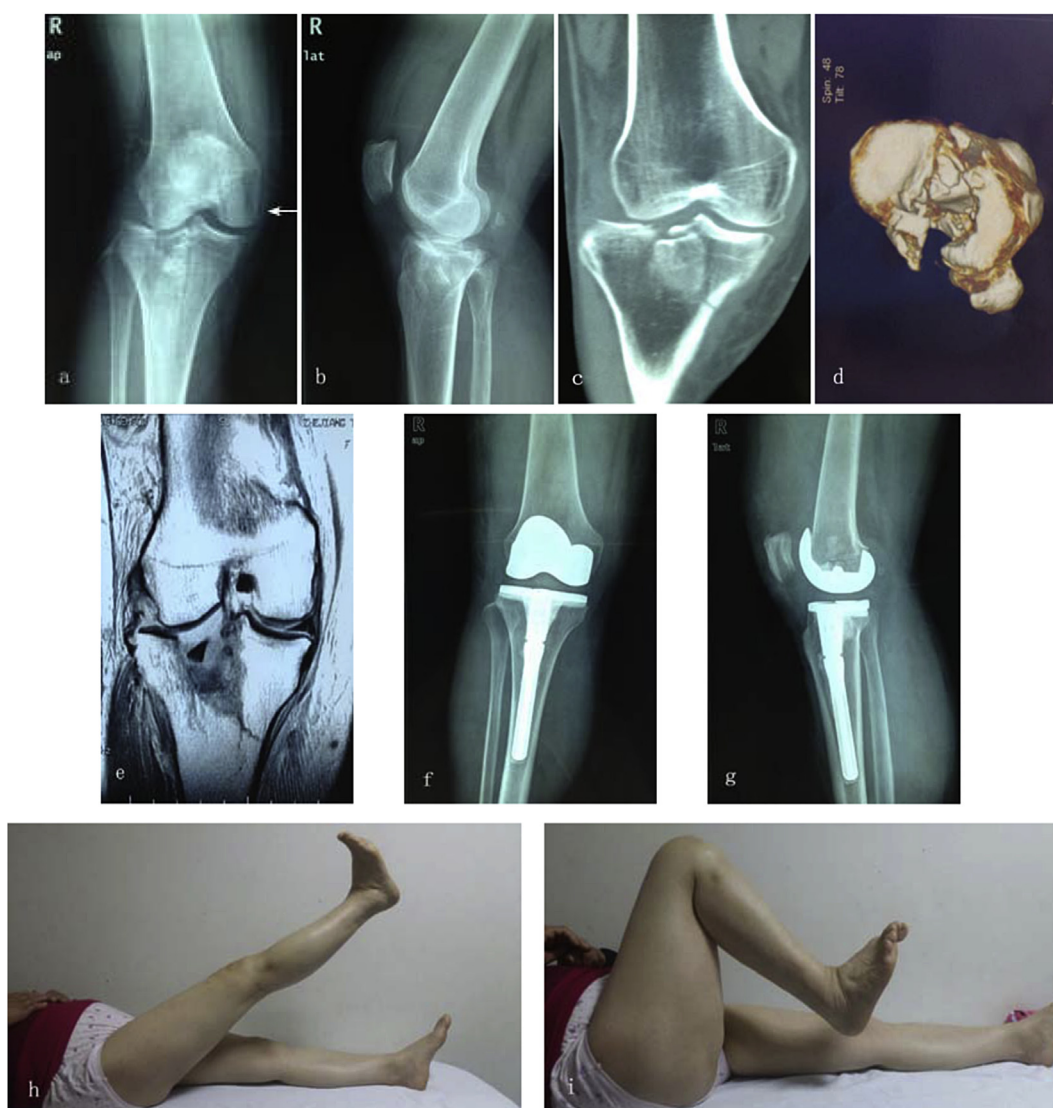
Fig. 1. Preoperative radiographs of a 58-year-old woman with Schatzker type-V complex tibial plateau fracture with a compromised knee subluxation and MCL injury (←) (a, b). Preoperative three-dimensional computed tomography (CT) and Magnetic Resonance Imaging (MRI), (c, d, e). Postoperative radiographs of the knee after performance of TKA for 2 years with NexGen LPS femoral component and NexGen LCCK tibial component, (f, g). Photographs of Knee ROM 2 years after surgery, (h, i). This patient had an excellent result for HSS knee score 92.

All the procedures were performed by the Senior Author (Pei-Jian Tong). Using a pneumatic tourniquet applied about the upper thigh, the standard medial parapatellar approach was adopted. A medial parapatellar arthrotomy was performed in all the cases to evert the patella. Pay attention to prevent patellar tendon rupture while the surgeons attempt to obtain adequate exposure.