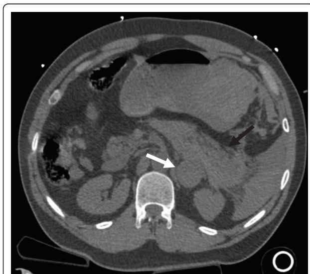
Figure 1 CT scan of the abdomen with left adrenal mass (white arrow) and associated intra-peritoneal hemorrhage (black arrow) obtained on presentation to the outside hospital.

Serum metanephrines and normetanephrines levels were found to be markedly elevated at 14.0 nmol/L (reference range 0.00-0.49) and 24.3 nmol/L (reference range 0.0-0.89) respectively. Thereafter, his recovery was relatively unremarkable; he underwent two additional procedures to restore bowel continuity and for abdominal wall closure. He was discharged in good condition