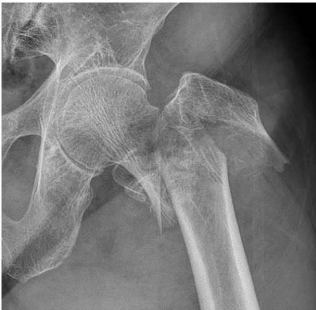
Fig. 1. Anteroposterior radiographs of 4 part fracture.

Statistical analyses were conducted with the SPSS ver.