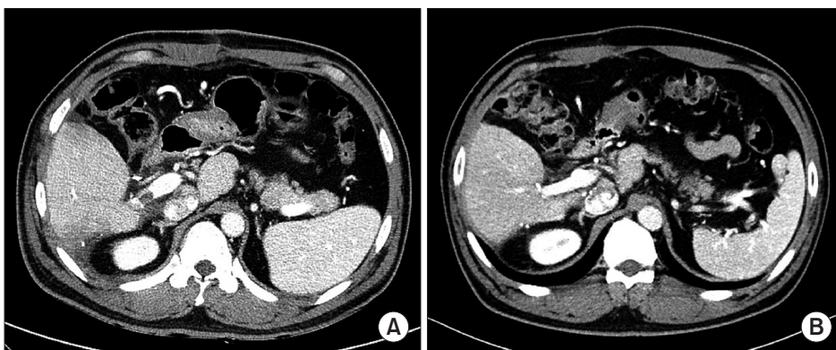
Fig. 2. (A) Peripheral portal vein thrombosis was discovered on the first week after hepatectomy and (B) it was disappeared after 3 months of anticoagulation therapy.