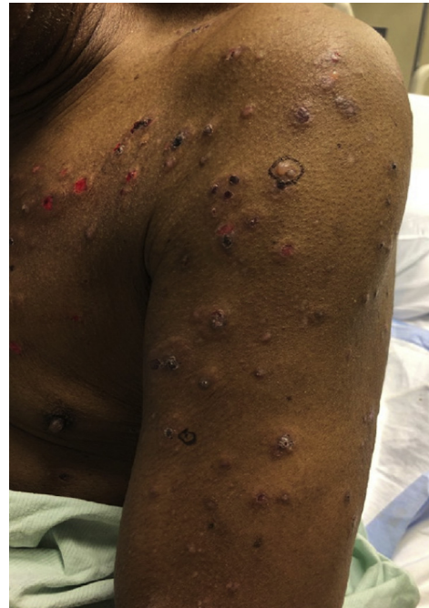
Fig 1. Numerous tense bullae, erosions, and crusted plaques present on the left side of the upper extremity and upper side of the chest on initial presentation.

Herein, we present a case of bullous pemphigoid treated with systemic corticosteroids and mycophenolate mofetil complicated by immunosuppressive sequelae that resulted from intake of dosages exceeding prescribed amounts. Bullous pemphigoid, an autoimmune skin disorder characterized by IgG and also immunoglobulin E autoantibodies against hemidesmosomal proteins BP180 and BP230, can be treated with corticosteroids, nonsteroidal anti-inflammatory agents, or both, plus adjuvant immunosuppressant therapies if disease is severe. Mycophenolate mofetil, one of these immunosuppressant therapies, is typically used in doses