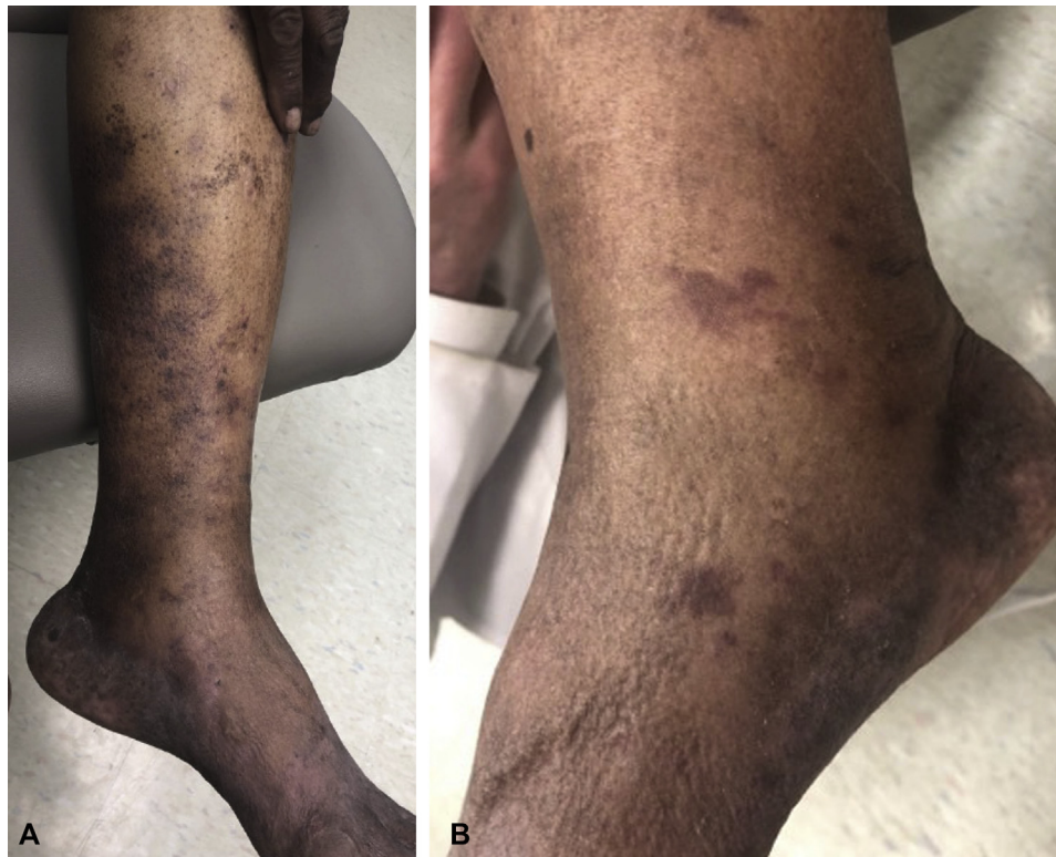
Fig 2. A , Retiform purpura on the left side of the lower extremity. B , Branching purpura focally on the medial side of the right ankle.