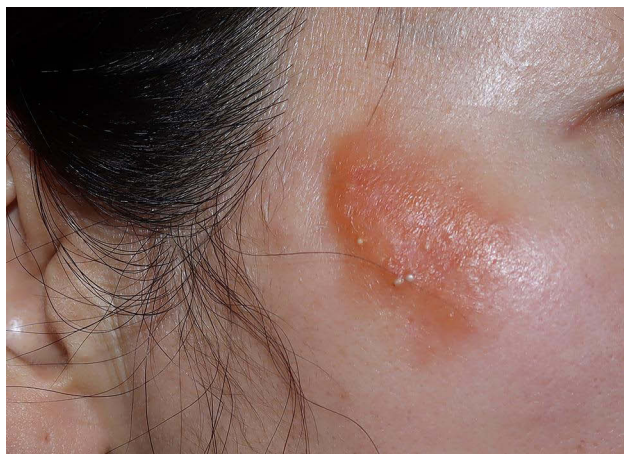
Figure 1 Orange–yellow plaque with overlying scattered 2 mm whiteish blisters on the right zygomatic area.