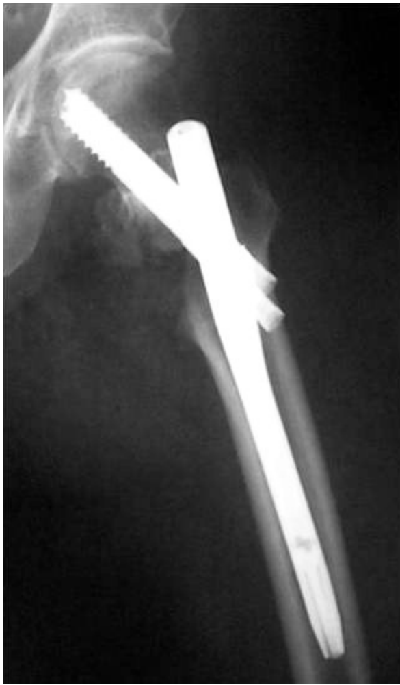
Figure 7 At final x-rays, the 2 proximal screws were inserted slightly convergent and retroverted. The femoral head reduced in slight valgus and gap at the medial site of the fracture is noticed at final x-rays.

superior to ENDOVIS group which was statistically significant. The favorable results of IMHS group are probably explained by design differences. It seems that IMHS allows for a more accurate nail placement, secure and stable fixation with lesser complications and failures. Subsequently this is reflected to the greater walking independence of the patients and their advanced rehabilitation.