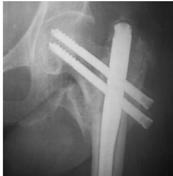
Figure 8 Pertrochanteric fracture treated with ENDOVIS nail.

Devices combining the general principles of the sliding hip screw with an intramedullary nail constitute a safe and accurate mode of fixation for pertrochanteric fractures. Certainly, further investigations are necessary in order to prove the ideal treatment method for these fractures. However, this study indicates the IMHS device as suitable for the treatment of stable pertrochanteric fractures, those with reverse obliquity, comminuted