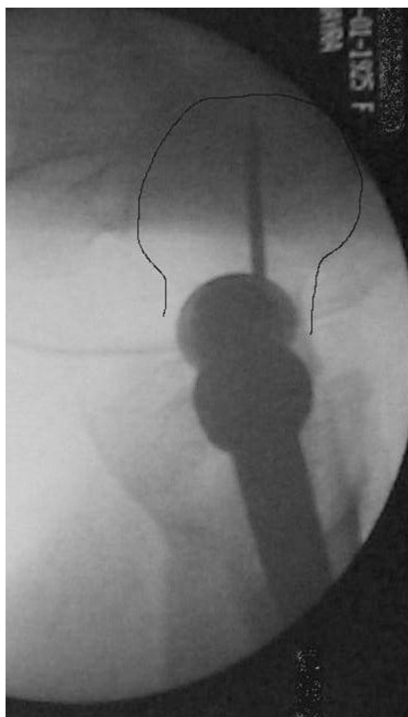
Figure 5 Guide wire, for screw reaming, is inserted just below midline in AP, close to the articular surface.