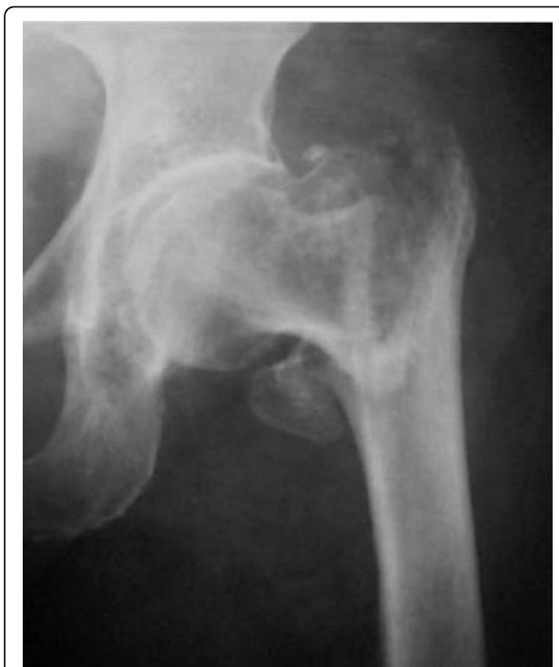
Figure 3 Comminuted unstable pertrochanteric fracture treated with ENDOVIS nail.

Controlled fracture impaction and axial loading are of significant importance especially in the unstable pertrochanteric fractures [19,20]. These factors allow direct contact between the fracture fragments; promote healing, decrease the moment arm and the stresses on the implant. Compression at the fracture interface can be done intra-operatively by tightening the compression screw, adding stability to the bone-hardware construct. ENDOVIS doesn't provide the ability for intra-operative compression. Compression occurs during the healing process, under fracture loading. However, this phenomenon was not controlled and cephalic screws back-out or joint penetration was noticed in 8 cases, although initial screw placement in the femoral head was considered optimal (Fig. 8, 9). In contrast no such complication was noticed in the IMHS group.