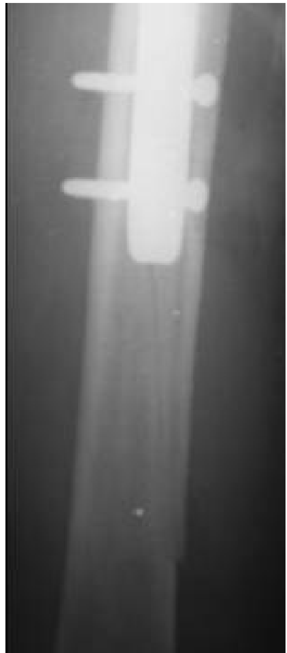
Figure 2 Periprosthetic fracture at the distal tip of the IMHS three months postoperatively.

The ideal implant for stabilization of pertrochanteric fractures is still under debate. Many authors consider the sliding hip screw with a plate the best choice, extenuating its favorable results, the low rate of hardware failure and non-union. A recent metaanalysis compared the sliding screw and plate with intramedullary nails (IMN) [12]. Total fixation failure rate was higher in the IMN group, without reaching statistical significance. However, intramedullary nails gain a continuous popularity for