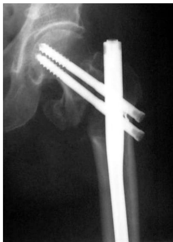
Figure 6 Guide wire, for screw reaming, is inserted in the midline in lateral view, close to the articular surface.

complications and resulted in an increased number of revisions. In contrast, the single femoral head screw of IMHS eliminates these complications and moreover provides an ease and safe solution, particularly in narrow femoral necks, where the positioning of two cephalic lag screws is not always feasible.