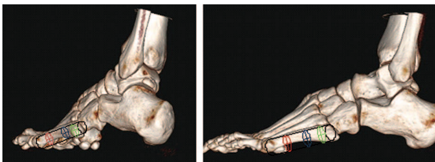
FIGURE 2. 3D CT scan and measurement points.

In 93% of the metatarsals the internal diameter was > 4 mm. Two of the metatarsals had an internal diameter of less than 4 mm (7%). Eight out of 27 (30%) of the analyzed feet revealed fifth metatarsal internal diameters with > 5.5 mm. See Figure 1.