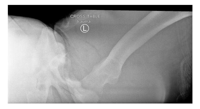
Figure 1B. Cross-table plain film radiograph of left hip following dislocation.

The subject reported medial left knee pain with active end range left knee flexion, and had an empty endfeel secondary to pain with gentle left hip internal rotation, flexion, and extension. The subject presented with positive grade 1 left knee valgus stress test (mild pain, no gapping apparent), and tenderness to palpation in the left psoas, distal biceps femoris, and medial collateral ligament. Resisted left knee flexion reproduced the subject's posterior mid-thigh complaint. The subject's static right lower extremity balance was within normal limits, however the left was not tested in consideration of precautions. He presented with a positive trace left knee effusion as assessed by sweep test and recorded a 51/80 on the Lower Extremity Functional Scale. Dermatomal light touch was intact and deep tendon reflexes were 1+ throughout bilateral lower extremities.