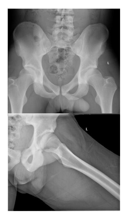
Figures 2A & 2B. Plain film radiographs of left hip and pelvis, anterior posterior view, and 'frog leg' position following successful reduction.

This case report describes the successful return to sport of a Division I football player who sustained a traumatic pos-