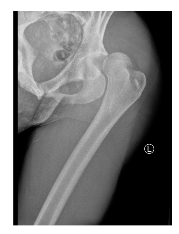
Figure 1A. Plain film radiograph of left hip demonstrating posterior dislocation

Minimal description of conservative management and rehabilitation for football athletes following traumatic hip dislocation exists in the literature. Cooper et al.<sup>12</sup> reported the case of a professional running back who experienced a hip subluxation with posterior acetabular fracture with onset of aseptic necrosis identified by MRI six weeks after injury. He was able to return to play after after eight months of conservative management, however there is minimal detail presented in the report of said conservative care. Yates et al.<sup>5</sup> described a single case of a high school football player that experienced a posterior hip dislocation who completed conservative care in five months and successfully completed the following football season. Philippon et al.<sup>13</sup> reported on 14 cases of professional athletes that required arthroscopic intervention after hip dislocation (12 posterior), all of whom returned to full play. Of those cases, five were football players, and three of them did not undergo surgery until greater than 90 days after injury, implying failed conservative management. However, their conserva-