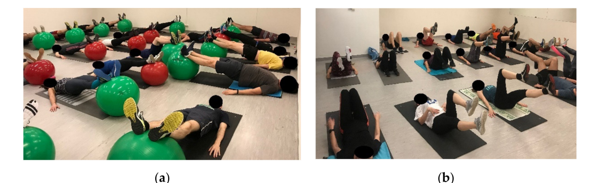
Figure 7. Segmental stabilization in unstable bilateral supine plank (a) and in stable unilateral leg lowering (b).

bilateral 90 degrees of hip and knee flexion to unilateral and then bilateral hip and knee extension (Figure 7b). A Swiss ball was used in sitting exercises for tilting the trunk to the anterior and posterior directions, in supine exercises for abdominal crunches and hamstring curls, and in prone exercises for back extension while maintaining segmental stabilization of the core. The standing exercises were lunges, squats and repeated bilateral side-step squats (Figures 7 and 8).