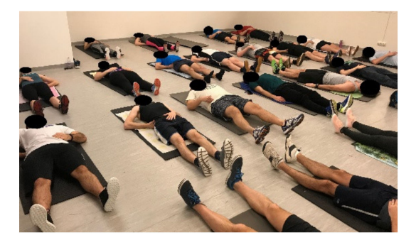
Figure 3. Segmental stabilization.

The goal of this phase was to teach and enable the practice of conscious, voluntary segmental lumbopelvic stabilization using the abdominal drawing-in maneuver (ADIM) [37]. The participants were asked to lie on the mat in a straight but relaxed position and search and feel for the proper neutral position of the pelvis and lumbar spine. Verbal explanations helped in the required positioning, and the subjects had been taught to manually palpate and control the anterior superior iliac spine (SIAS) and symphysis pubis in line with the horizontal plane. After correct positioning, the subject was taught—following Saliba et al. [38]—to contract the deep core musculature, focusing on the multifidus, abdominal transverse, and pelvic floor muscles, without the contraction of superficial muscles or any movement of the pelvis and spine. The verification of proper contraction was carried out by both the physiotherapist and the subject. Supine bridging was performed with a slow hip extension by raising the pelvis and the trunk in a block by hip extension until reaching the trunk and femur in line (Figure 3).