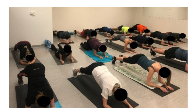
Figure 5. Prone bridging (plank).

2.3.4. Segmental Stabilization Combined with Dynamic Exercises on Stable and Unstable Surfaces