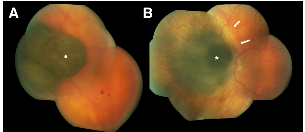
FIGURE 2: Fundoscopy

A: Pigmented mushroom-shaped (star) choroidal melanoma obscuring the optic nerve, measuring 12 x 12 x 8.6 mm in thickness. B: One year after Cyberknife treatment, the tumor has markedly regressed (star). Note the rim of chorioretinal atrophy surrounding the tumor (arrows).