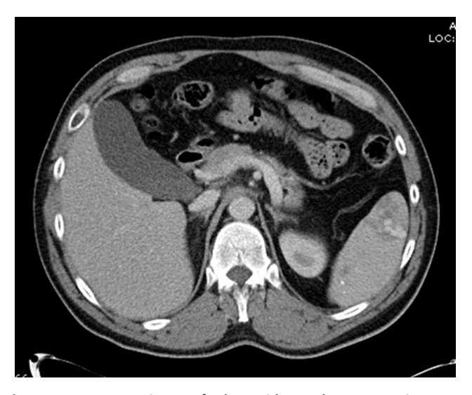
Figure 4 Transverse image of spleen with pseudoaneurysms in the upper pole. Contrast is poorly timed as neither the aorta nor pseudoaneurysm appear bright.

Conventional patient monitoring includes the tracking of vital signs, performance of serial physical examinations, and obtaining several hemoglobin levels, all of which can be helpful in determining if the patient is hemodynamically normal and if bleeding