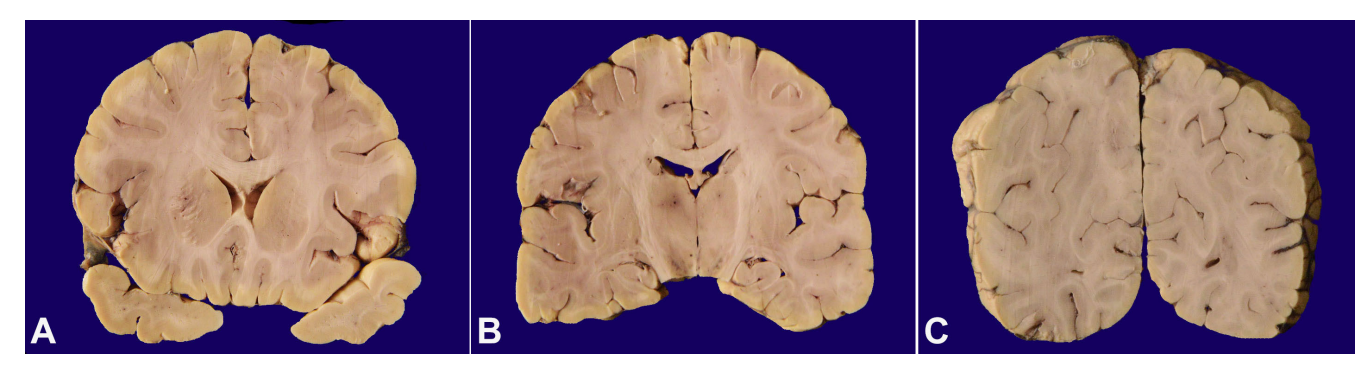
Figure 2. Gross view of the brain. A – Coronal section showing irregularity in left anterior limb of internal capsule extending to head of caudate; B – Prominence of intraparenchymal vessels in bilateral thalamus; C – Loss of greywhite junction noted in left striate cortex with surrounding edema.

ALP: Alkaline phosphatase, ALT: Alanine transaminase, AST: Aspartate transaminase, CRP: C-reactive protein, ESR: Erythrocyte sedimentation rate, Hb: Hemoglobin, RBC: HCT: Hematocrit, HCV: Hepatitis C virus, HbsAg: Hepatitis B surface antigen, HIV: Human immunodeficiency virus, LDH: Lactate dehydrogenase, MCH: Mean corpuscular hemoglobin, MCHC: Mean corpuscular hemoglobin concentration, MCV: Mean corpuscular volume, Ptl= platelets, RDW: Red blood cells, Red cell distribution width, TLC: Total leucocyte count, T bil: total bilirubin, D bil: direct bilirubin.