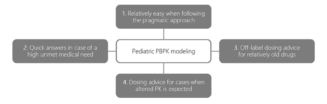
Fig. 1 Pediatric physiologically based pharmacokinetic (PBPK) modeling as an attractive tool to support or establish pediatric drug dosing recommendations