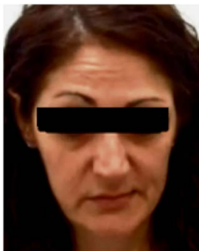
Figure 2. Mandibular displacement after first botulinum injection.