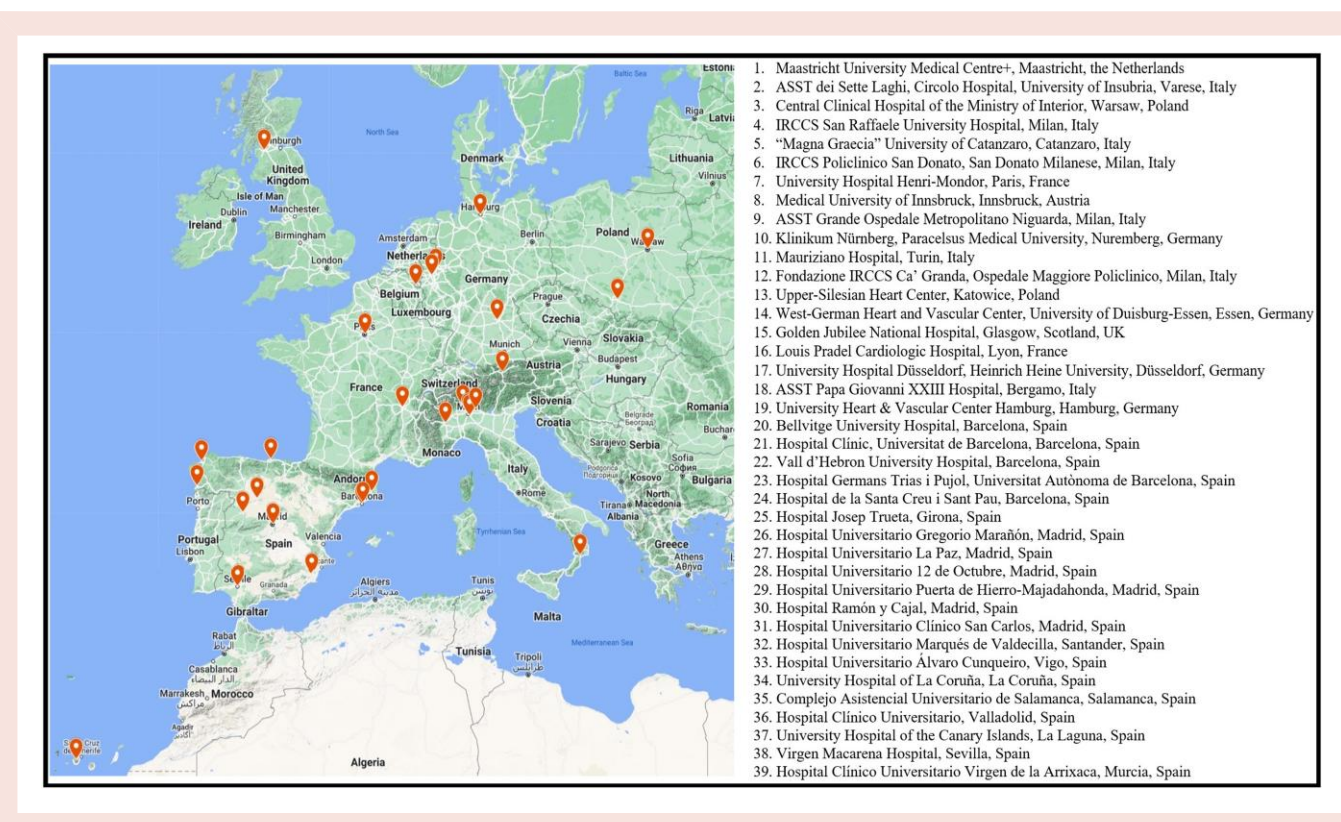
Figure 1 Distribution of European centres participating to the survey.

Coronarography was performed routinely in two-thirds of the centres, regardless of haemodynamic conditions. Figure 2A shows the widely variable preferences concerning coronary revascularization in this setting.