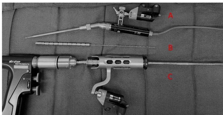
Figure 1. Instruments needed for safe placement of thoracic, lumbar, and sacral pedicle screws using the virtual screw technique. (A) Stryker electric drill with navigation tracker interface and 3-mm matchstick drill bit. (B) Pedicle feeler. (C) Stryker Instruments Cordless Driver 3 with navigated tip interface coupling ring, tracker interface, handle interface, and tap.

and confirm visualization of exposed anatomy. If any deviation is seen, the navigated Stryker electric drill is re-registered, and, if needed, another intraoperative CT may be performed.