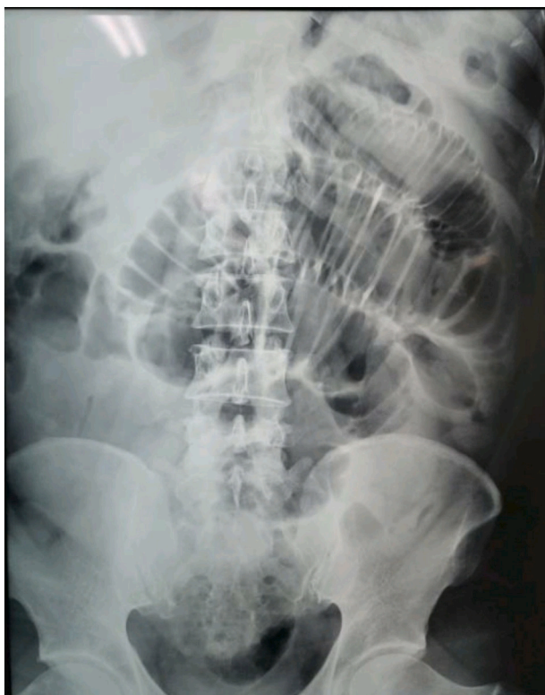
Fig. 1. Plain abdominal X-ray showing dilated proximal peripheral bowel loops, and collapsed distal ileal/large bowel loops.

Post-operatively, NG intubation was maintained for 3 days, and oral feed was initiated after the patient started to pass flatus. His post-operative period was uneventful and was discharged on the 8th post-operative day. On follow up the patient exhibited normal wound healing with no further complications.