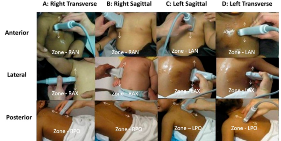
B: Right Sagittal C: Left Sagittal A: Right Transverse

Data entry and statistical analysis. The patient information was entered into a specific online secure electronic database (REDCap, Vanderbilt University, Nashville, TN) by the designated data entry clerk. Patient information was collected