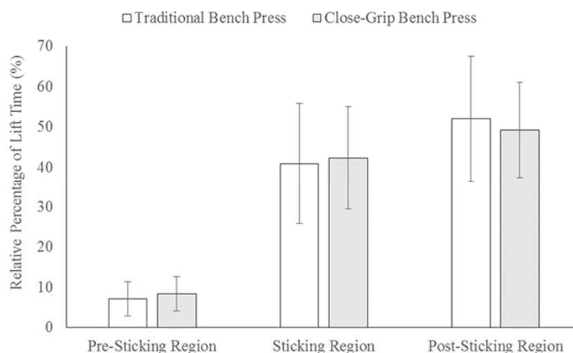
Figure 3. Durations of the pre-sticking region, sticking region, and post-sticking region relative to lift duration in a maximal traditional and close-grip bench press in resistance-trained men and women ( n = 27 ).