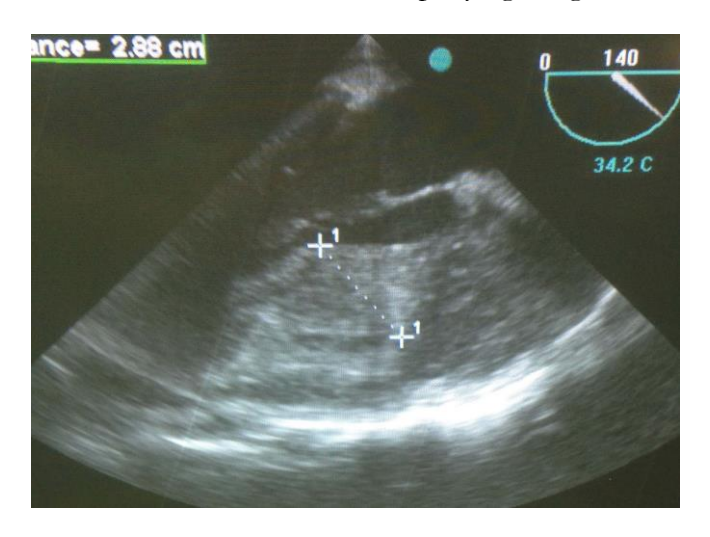
Fig.1: Echocardiography shows interventricular cyst

Based on medical Ethics Committee of Tehran University of Medical Sciences, a written informed consent was obtained from the patient for publication of this article and accompanying images.