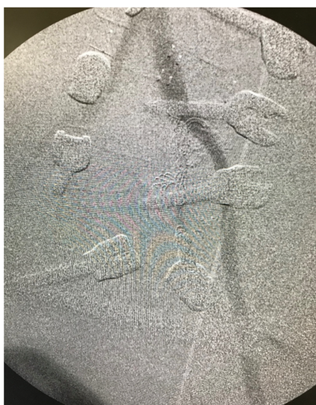
Fig. 2 The pseudoaneurysm disappeared after coil embolization using the isolation technique.

and supine positions, the discectomy wound was immediately closed, and the patient was maintained in the supine position for laparotomy due to the abdominal compartment syndrome. After evacuating the large retroperitoneal hematoma, her vital signs resolved completely. The patient experienced multiple organ failure after the operation, so she was kept in the intensive care unit for seven days. She was discharged in good condition after rehabilitation.