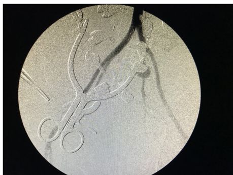
Fig. 1 Pelvic angiography revealed a pseudoaneurysm with extravasation in the right internal iliac artery.

While the bleeding was eventually stopped with compression of the puncture site for over 30 min in the prone