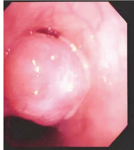
FIGURE 2: Reddish-orange smooth tissue mass obstructing the take-off of the left upper lobe bronchus.

Endobronchial carcinoid tumors in adults are rare ( <1\% of all lung cancers) but are the most common intrabronchial