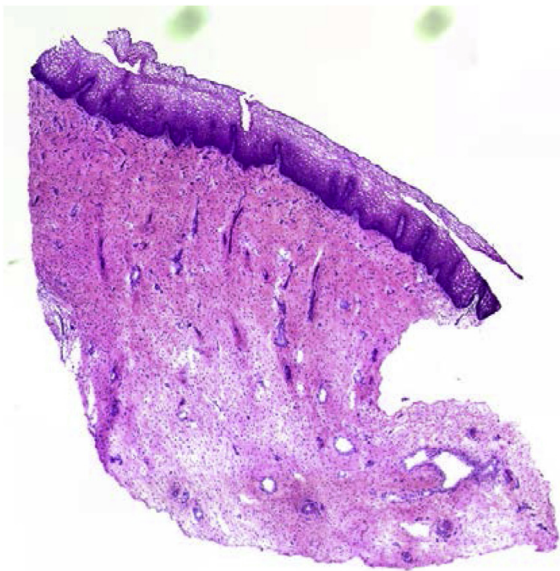
Fig. 2. Representative cervical tissue H&E staining of freeze-thawed cervical tissue. Composite representation of sequential images of an H&E stained section of cervical tissue that had been frozen, cryopreserved, thawed then cultured to d1.

Cervical tissue freezing and viable recovery has seldom been described in detail though Gupta et al., briefly communicated a method during their development of a cervical tissue-derived organ culture model [4]. Gupta and colleagues, using haematoxylin and eosin staining, showed that fresh as well as frozen-thawed cervical tissue maintained its integrity. In addition, they showed that there were no significant differences in the expression levels of cytokeratin and Ki67, two non-immune cellular markers, using immunohistochemistry. Furthermore, they demonstrated that both fresh and freeze-thawed tissue supported HIV-1 transmission and were equally useful for testing antiretroviral compounds. Our studies of tissue viability complement these findings and add important additional evidence, in addition to more comprehensive