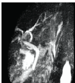
Figure 4: Postoperative magnetic resonance cholangiopancreatography confirmed that the operation was performed safely with no bile duct damage.