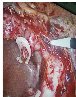
Figure 1: The suspected second cystic duct was found accidentally during the surgery.

The patient was taken into the operating room and prepared for laparoscopic cholecystectomy. Four portal accesses were inserted, and CO 2 was used for the insufflation of the abdominal cavity. Two cystic ducts were seen in the Calot triangle: one originating from the choledochal duct and the other from the common hepatic duct (figure 1). Both cystic ducts and the artery were dissected free and secured. A plastic hemolock clip was applied to the artery, and both cystic ducts were clipped using three hemolocks (figure 1-B). Before hemolock application on the second cystic duct, to perform a safe operation, we carefully dissected the gallbladder antegradely