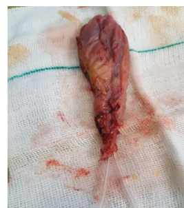
Figure 3: A Nelaton catheter was passed after the antegrade dissection of the gallbladder to confirm the second duct. The excised gallbladder showed two cystic ducts converging into the infundibulum.

from the fundus to the suspected second cystic duct (figure 2). However, the gall bladder was perforated during the procedure, and its contents spilled into the abdominal cavity. Washing with normal saline was performed multiple times to remove the gallbladder contents from the cavity completely. Ultimately, all portal defects were repaired.