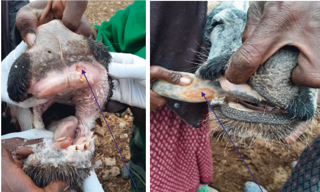
FIGURE 1: Gum and tongue lesion observed on cattle infected with foot and mouth disease.

2.9. FMD Viral RNA Extraction and PCR Amplification. Total RNA was extracted from collected FMD-suspected clinical sample suspension using Qiagen RNA extraction kit following the manufacturer's instructions as [27]. Briefly, 140 microliters of sample suspension was added to 560 \mu l buffer AVL carrier RNA in the microcentrifuge. The tubes were briefly centrifuged to remove drops from the inside of the lid. Then, 560 \mu l of ethanol (70%) was added to the sample and mixed by pulse vortexing for 15 seconds followed by centrifuging to remove drops from the inside lid. Then, 630 \mu l of the solution was applied to the QIAMP Minispin column in a 2 ml collection tube and centrifuged 12,500 rpm for 1 min. The filtrate was discarded, and the column was placed in a fresh 2 ml collection tube. Then, 500 \mu l of buffer AW2 were added and centrifuged at 12,500 rpm for three min and the filtrate was discarded. Next, 65 \mu l of Buffer AVE was added to the column equilibrated at room temperature for one min and centrifuged at 12,500 for 1 min. Using reverse transcription polymerase chain reaction (RT-PCR) and specific primers set FMDV7-forward (FMDV7F) and FMDV7-reverse (FMDV7R) as depicted in Table 1, extracted RNA samples were detected for the presence of FMDV.