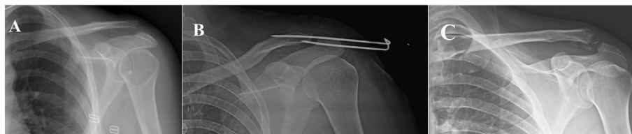
Fig. 2. (A) Type 3 acromioclavicular injury. (B) Postoperative image showing the fixation with K-wire. (C) Image from the postoperative 72nd month showing the ligament ossification.