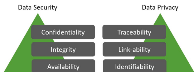
Fig. 3 General Comparison between Privacy and Security

IoHT must support mobile services strongly, which is considered a challenge especially in environments where the