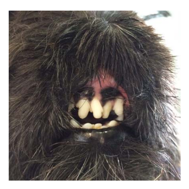
Figure 3. Frontal view of the muzzle five months after the removal of stents.