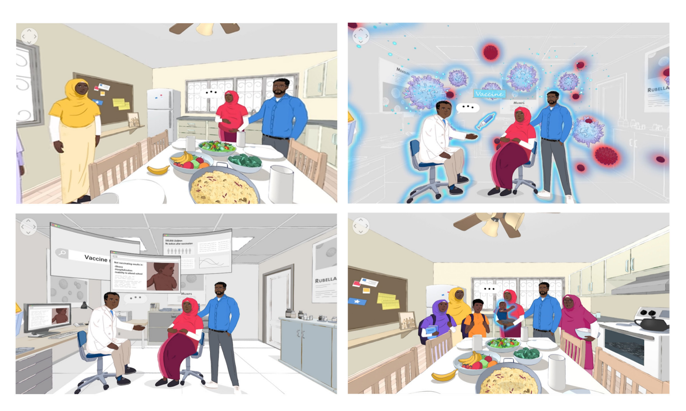
Figure 3 Top row: chapters 1 and 2 of the VR story. Bottom row: chapters 3 and 4 of the VR story. In chapter 1 of the animation, the expectant mother, her husband, and her sister visit the doctor's office and learn about measles, mumps and rubella (MMR). In chapter 2, the family learns how the immune system works. In chapter 3, the family learns from the doctor what the MMR vaccine does and how it works. In chapter 4, the doctor explains to the family the risks and benefits of MMR vaccination, including a statement debunking the association between autism and vaccination. Finally, the 360° video concludes by showing the new mother and her family—including the new, healthy baby—and the new mother states that after learning all the facts, she has decided to vaccinate her child. VR, virtual reality.

24 (83%) participants stated that they would recommend MMR vaccination to members of their community following exposure to the prototype. Additionally, 21 of 24 (88%) said they planned to vaccinate their children following exposure to the prototype.