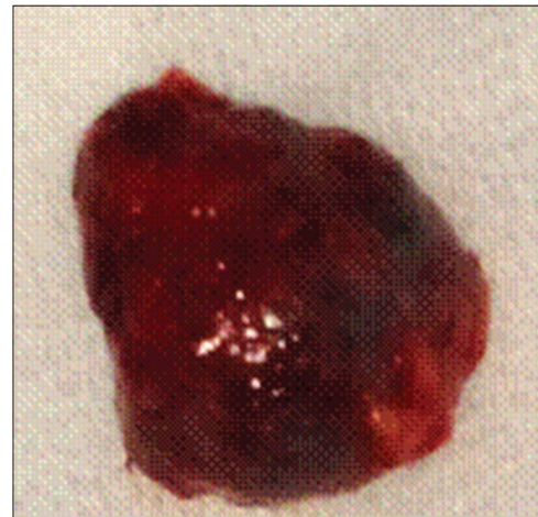
Figure 2: The specimen of the orbital tumor after resection