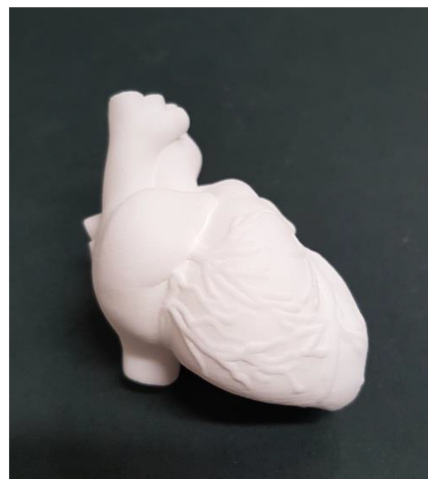
FIGURE 1 Image of the 3D printed heart anatomy model