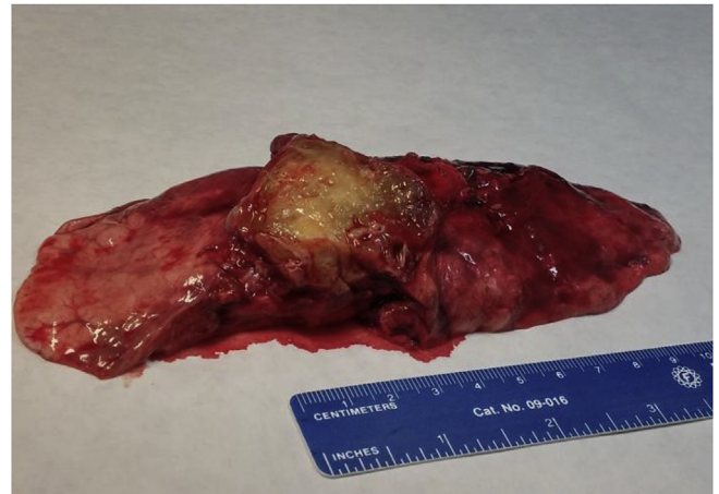
Fig. 2. Pulmonary cryptococcoma: A well circumscribed mass of the left inferior lung lobe.

On week 9, CSF analysis confirmed sterility and CrAg titre 1:10, concurrently with improvement of clinical presentation. Follow-up chest CT revealed unchanged lung lesion and the patient was submitted to an exploratory thoracotomy, which depicted a solid mass adhered to