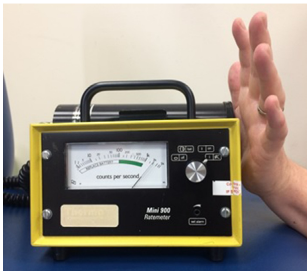
Fig. 4 – Contamination monitor (44A) registering 2000 counts per second.