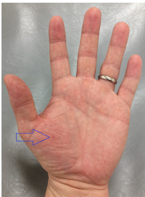
Fig. 1 – Site of needlestick injury (hollow blue arrow).

the dispensing of radionuclides from a multidose vial. The risk of radiopharmaceutical NSI is greatest to the hand and fingers during needle insertion/removal from the vial and during re-capping of needles for the safe preparation of radiopharmaceuticals. Current guidance states that re-capping prevents radioactive contamination of equipment and reduces the risks of dose to the operator [4] but does not address the associated risk of NSI. As a result, nuclear medicine staff remain exposed to the dangers of subcutaneous radioactive contamination typically not seen in other healthcare environments.