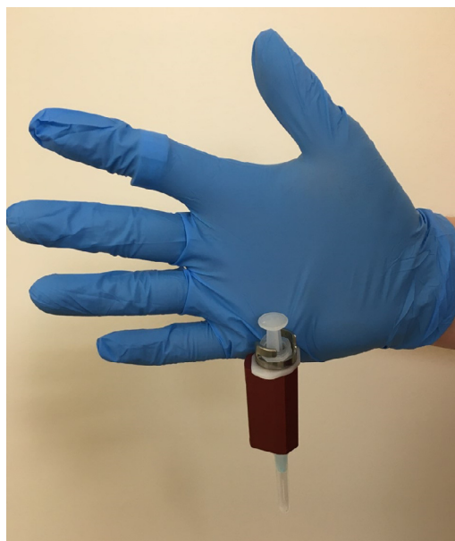
Fig. 3 – Recreation of glove entrapment within twist-lock mechanism.

mechanism whereby the proximal flange of the syringe is wedged into a fixed position (Fig. 2). Unfortunately, the surgical glove of the staff member was trapped within the mechanism during the re-capping procedure (Fig. 3). The unexpected pendulous motion of the apparatus subsequently led to a subcutaneous injury on the opposite hand which was promptly washed and encouraged to bleed.