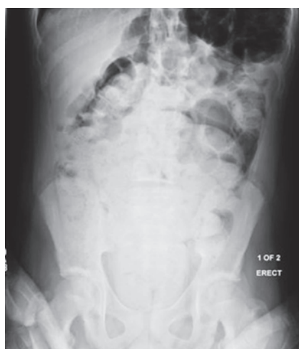
Figure 1. Abdominal radiograph showing fecal impaction.

3350 solution 17 gm twice daily and Bisacodyl 10 mg tablet once daily.