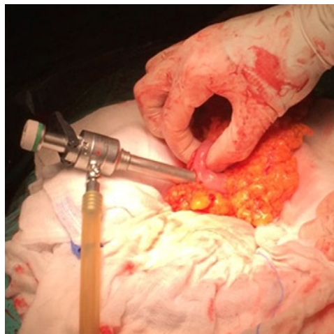
Figure 1: The insertion of the port at transverse colon and the isolated operation field with compresses.

Due to lack of data on the reported technique, it is a challenge to record new incidents and collect data in order to demonstrate its safety and effectiveness in the field of small intestine, colon and stomach surgery, in the absence of a colonoscope or gastroscope, taking also into account the lower time required by this method compared with the use of a colonoscope and gastroscope from the anus and the mouth, respectively.