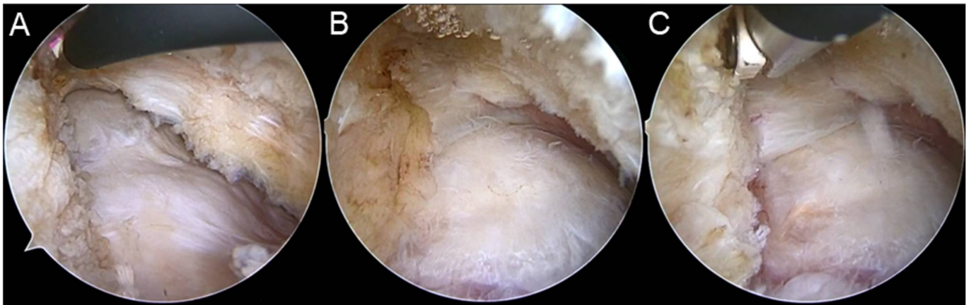
Figure 1. The procedures of modified longitudinal capsulotomy. (A) After the longitudinal capsulotomy was performed using radiofrequency probes, the arthroscopy was entered the hip joint and the femoral head–neck junction was exposed. (B) The longitudinal incision was extended proximally until the acetabular labrum was exposed. (C) A 1 cm transverse incision vertical to the longitudinal capsulotomy was performed in the proximal end of longitudinal incision.