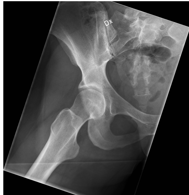
Figure 1 Right hip, preoperatively.

Plain radiographs of the right hip in the anterior-posterior view (modified Dunn projection, hip flexed 45° and abducted 20°) revealed an alpha angle of 60° compared with 50° for the left hip. 23 The center-edge (CE) angle was 30° for the right hip and 32° for the left hip. The cross-over sign and ischial spine sign were negative bilaterally. Radiographs are shown in Figures 1 and 2. The joint space was 5 mm in the