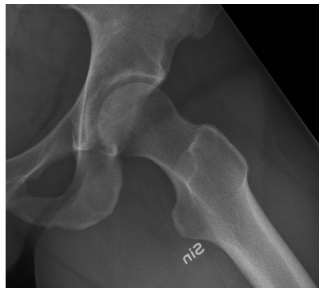
Figure 2 Left hip, pretreatment and before debut of symptoms in the left hip.