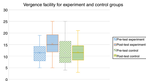
Figure 2 Box and Whisker plot showing mean changes (cpm) in vergence facilities in the experimental and control groups after 25 min of gaming using VRD.