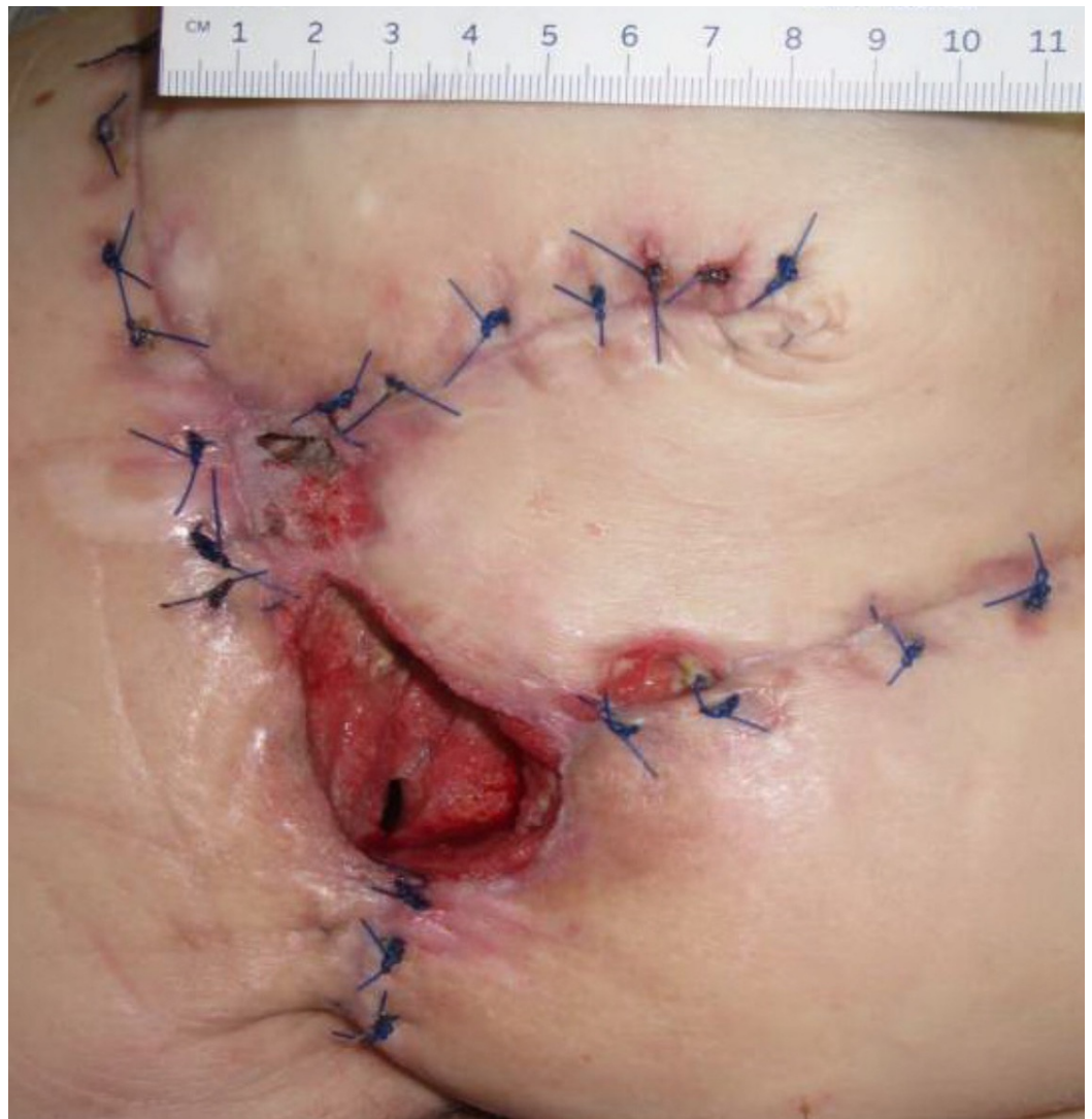
FIGURE 2: Day 8

4.0 cm x 3.8 cm x 4.7 cm (Length x Width x Depth)