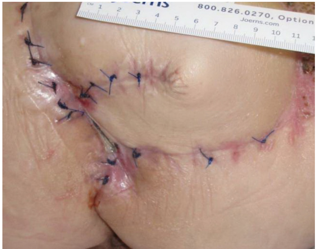
FIGURE 7: Day 57

0.5 cm x 0.2 cm x 0.0 cm (Length x Width x Depth)