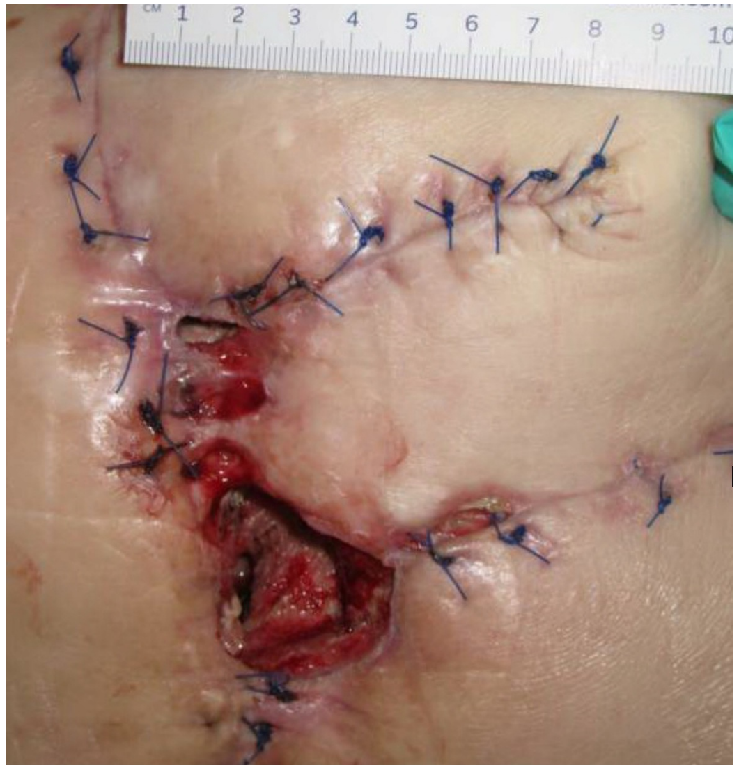
FIGURE 1: Day 1

3 cm x 1.5 cm x 7.5 cm (Length x Width x Depth)