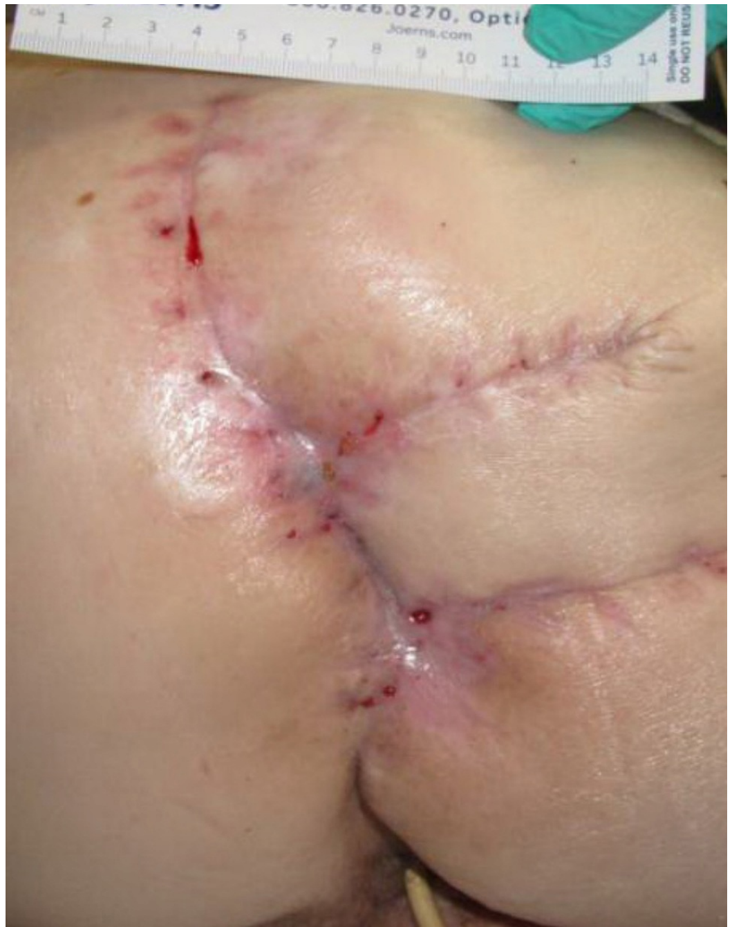
FIGURE 8: Day 64