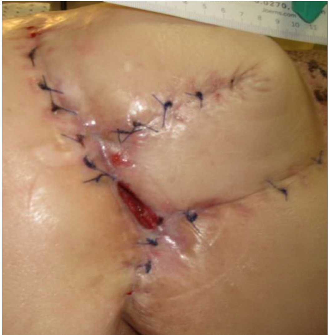
FIGURE 6: Day 50

0.6 cm x 2.7 cm x 0.7 cm (Length x Width x Depth)