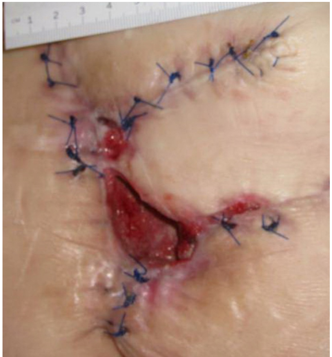
FIGURE 3: Day 15

4.0 cm x 3.5 cm x 6.5 cm (Length x Width x Depth)