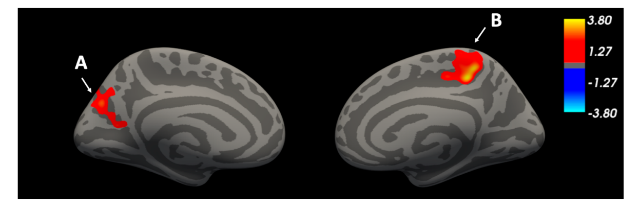
Figure 2. Impulsive urgency predicts greater cortical thickness in two clusters, adjusting for age, sex, and BMI. ( A ) Left superior parietal lobule, precuneus, superior occipital gyrus, and cuneus. ( B ) Right paracentral lobule, precuneus, and posterior cingulate gyrus.