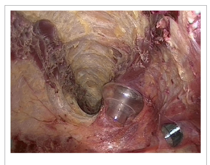
FIGURE 4 | Approximately 5 cm release of the oblique external muscle at the level of the costal arch.

For the endoscopic component separation, we used a pressure of 10–12 mmHg CO<sub>2</sub>. In doing so, we abandoned the balloondissector used by Rosen and created the space between the internal oblique muscle and the external oblique muscle by digital preparation and then with the optics. Due to the opening of the external aponeurosis, a release of 5–6 cm could be achieved for each side, significantly more than for the posterior component separation ( Figure 4 ). A tissue-sealing device should be used for the separation of the muscular portion of the external aponeurosis in the region of the ribs. In the majority of cases, there is no need to use redon-drainages (Video S2 in Supplementary Material).