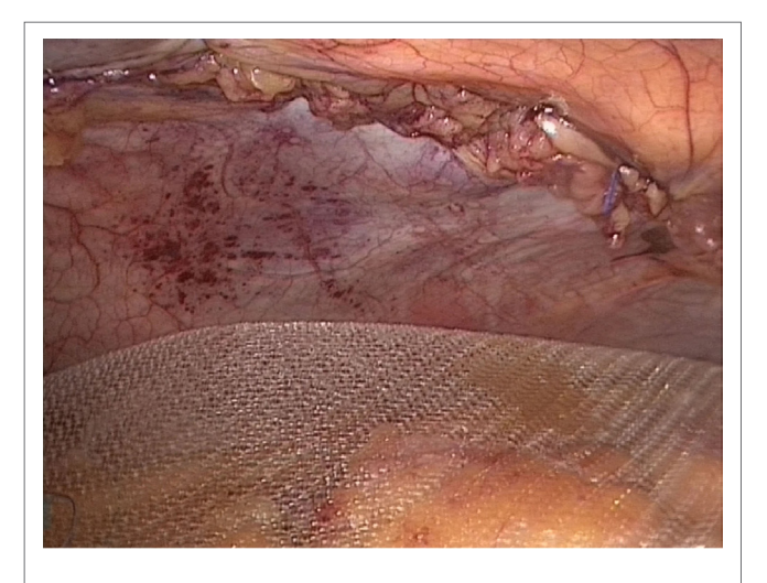
FIGURE 2 | Complete closure of the linea alba prior IPOM mesh implantation.