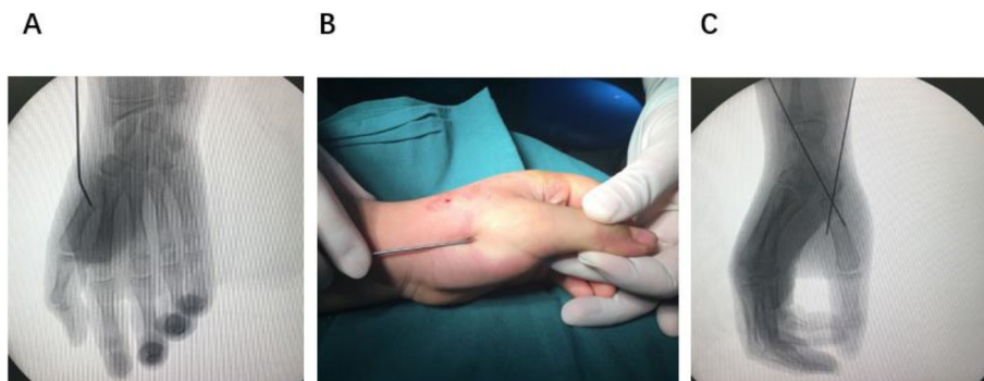
Fig. 3 Typical thumb metacarpal base RW-C fracture of left hand. a leverage reduction of the fracture. b aspect of leverage reduction. c C-arm result after pinning

The patients included 9 girls (56.2%) and 7 boys (43.8%), with an average age of 10.8 years (range 7.5 to 14.0 years). Female patients (mean age 10.3 years, range 8.0 to 12.0 years) were younger than male patients (mean age 11.5 years, range 7.5 to 14.0 years; p = 0.957 , Mann-Whitney U test). The most common causes of these fractures were falls and low-impact sports (81.3%, n = 13/16 ). In all, 37.5% ( n = 6/16 ) of the fractures were left-sided injuries, and 62.5% ( n = 10/16 ) were right-sided injuries. None of the injuries was bilateral. All were S-H II lesions, and none were open fractures. Percutaneous leverage reduction and DACK wire fixation were successfully performed within an average total surgery time of 20 min (range 12–32 min). Bone union was achieved in all patients within a mean time of 4.2 weeks (range 4–6 weeks). The average angulation (preoperation: 50.5°