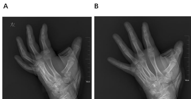
Fig. 1 Typical thumb metacarpal base RW-C fracture of left hand. a AP X-Ray of left thumb preoperative. b lateral X-Ray of left thumb preoperative

The first clinical review was conducted 2 weeks after surgery. Then, the patients were assessed radiographically for fixation and bone union 4 weeks, 6 weeks, 8 weeks and 6 months postoperatively and every 6 months thereafter. When calluses formed, the cast and K-wires were removed without anaesthesia, and active exercise