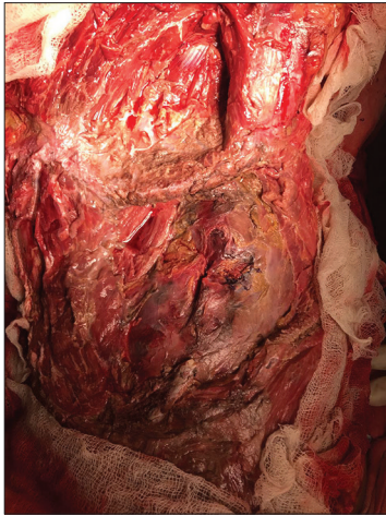
Figure 1: Intra-operative photograph of the left flank showing granulation tissue over the abdominal muscles following surgical debridement on the Intensive Care Unit day 1

A provisional diagnosis of mucormycosis was made, and liposomal amphotericin B (5mg/kg) was immediately started for fungal sepsis. Later, the fungal culture grew strains of Rhizopus oryzae , thus confirming the presence of invasive mucormycosis. However, the patient died on day 6 of ICU admission of severe septic shock.