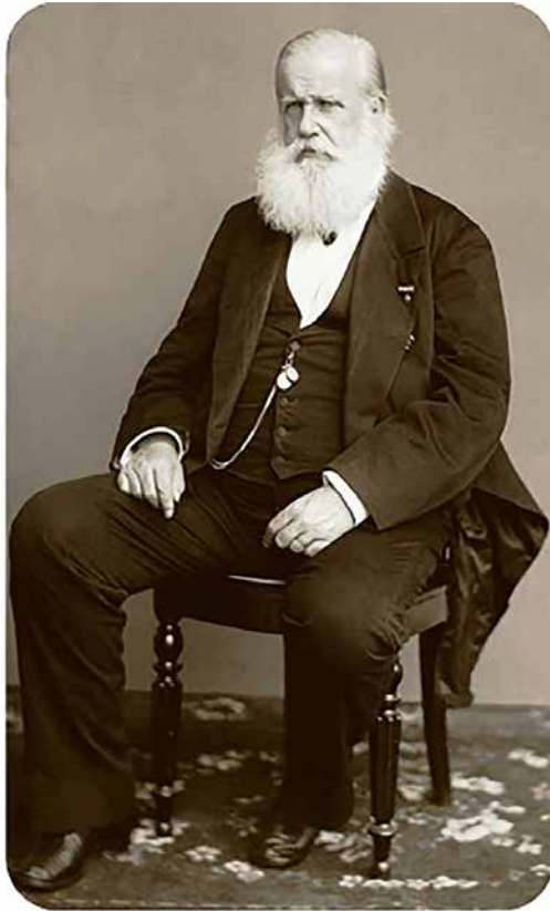
Fig. 2. Retrato de D. Pedro II of Brazil, 1885, by Marc Ferrez, Rio de Janeiro, RJ/Acervo IMS [34].