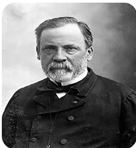
Fig. 1. French scientist Louis Pasteur (1822-1895), 1878

Louis Pasteur (*December 27, 1822, Dole, France-†September 28, 1895, Marnes-la-Coquette, France), was an outstanding French chemist and a chemist-turned-microbiologist, renowned for his discoveries of the principles of vaccination, microbial fermentation, and pasteurization. He is often called the founder of microbiology. He remained on the Faculty of Strasbourg until 1854, where he was appointed professor of chemistry in 1852. In 1873, he was elected to full membership of the Académie Nationale de Médecine. After 30 years spent at the Ecole Normale, in 1888, Louis Pasteur moved to a specially designed apartment at his Institut. Besides, on November 1, 1894, "he had an attack of uremia, and there followed a long, slow agony, lasting for months". On June 13, 1895, he left the apartment for Marnes-la-Coquette, where he died, on September 28, at age 73. Before in 1868, he took a paralysis on his left side. Still, despite a stroke at the age of 46, he was the director of the Institut Pasteur that was established in 1888, until his death [4,32,33].