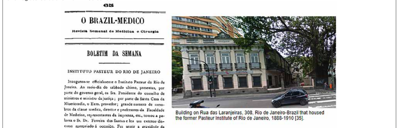
Fig. 3. Pasteur's Institute of Rio de Janeiro, responsible for preventive rabies vaccination where the first rabies inoculation was carried out in Brazil. It was the world's first Pasteur's Institute, established nine months before the Parisian one. The Institute was installed in a building previously owned by Viscondessa de Araújo, but bought by the Provider of the Santa Casa de Misericordia [15]. Its inauguration was acclaimed and registered at the Brazil-Médico [35].

The nineteenth century was a significant landmark in the history of vaccines since it witnessed discoveries made by Louis Pasteur, the father of microbiology, and many others [19] such as Pierre-Victor Galtier and Paul