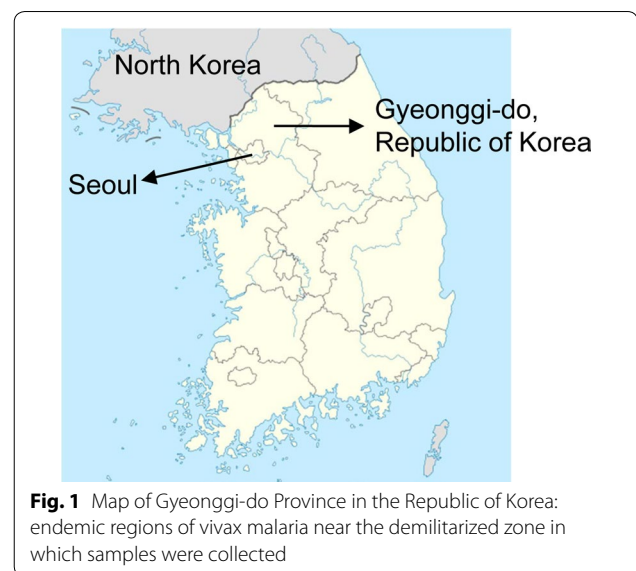
Fig. 1 Map of Gyeonggi-do Province in the Republic of Korea: endemic regions of vivax malaria near the demilitarized zone in which samples were collected

A total of 55 blood samples were collected from patients infected with malaria and admitted to the Armed Forces Hospitals near the demilitarized zone located in northern Gyeonggi-do Province in the northwest region of the